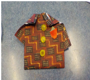
Cards for Fathers/significant other day